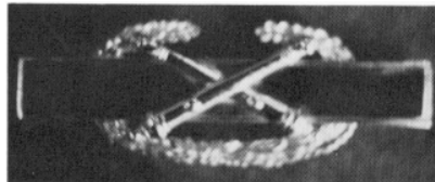
Figure 3. Japanese-made Combat Artillery Badge awarded by some commanders during the Korean War.

As the controversy raged, some commanders in Korea took the matter into their own hands. Unofficial Combat Artillery Badges were manufactured in Japan and awarded by local commanders. The most common design consisted of a red bar, wreath, and crossed field pieces (figure 3), similar