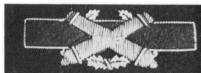
Figure 4. Japanese-made Combat Artillery Badge for dress blues.

to McDonough's design but without the musket. An embroidered version for the dress blue uniform was also put out by enterprising Japanese manufacturers (figure 4).